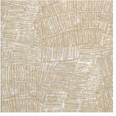
Dangaay Ochre on Natural White core