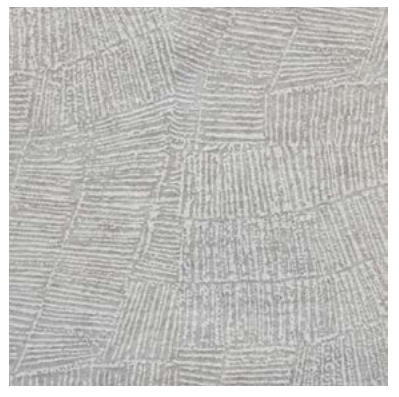
Dangaay White on Natural White core