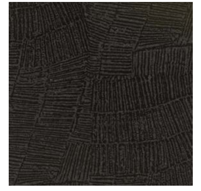
Dangaay Black on Taupe Black core