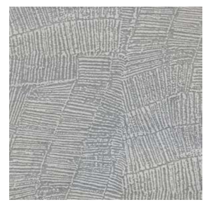
Dangaay White on Dove White core