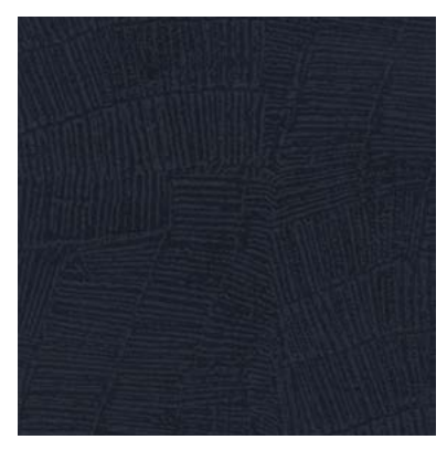
Dangaay Blue on Indigo Black core

Patterns shown are not to scale Product may vary in colour due to the nature of the media Please refer to website for current colour range