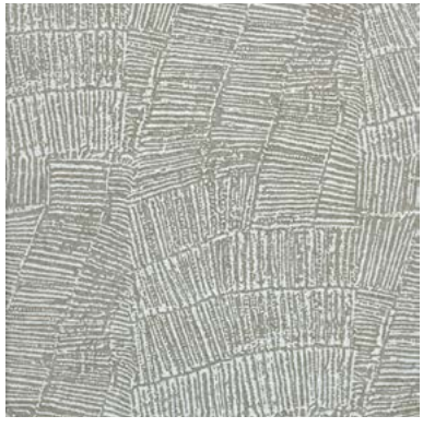
Dangaay Biscuit on Oyster White core