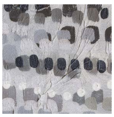
Burrawarra Granite White core

Patterns shown are not to scale Product may vary in colour due to the nature of the media Please refer to website for current colour range