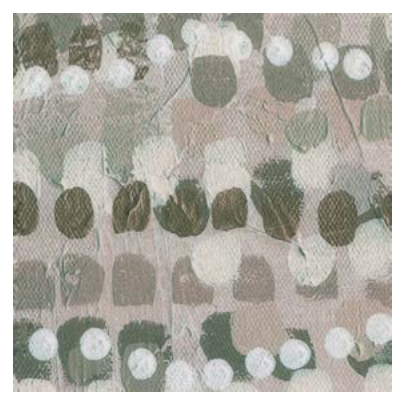
Burrawarra Ranges White core