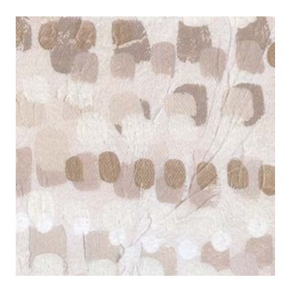
Burrawarra Pipeclay White core