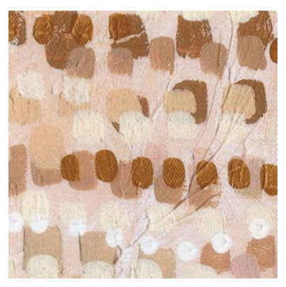
Burrawarra Desert White core