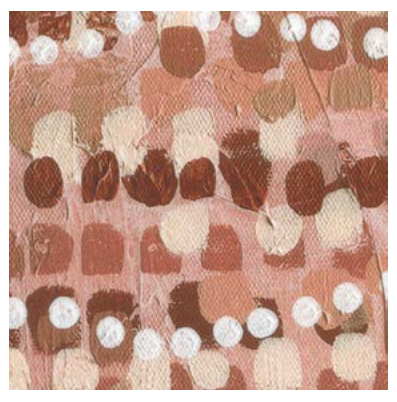
Burrawarra Earth White core