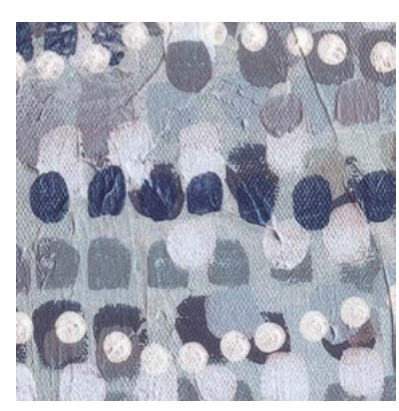
Burrawarra Bluestone White core