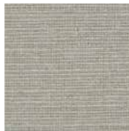
Silver Brunia ARP027