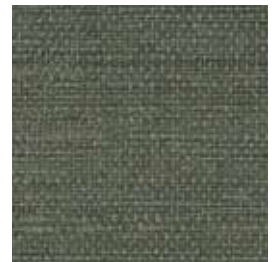
Velvet Bean ARP013