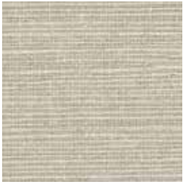
Brown Thistle ARP023