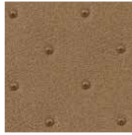
Pale Gold 177-H17