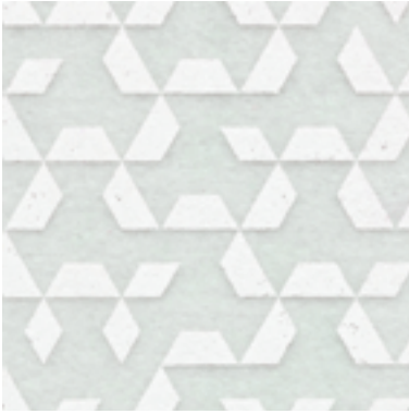
TRI White on White