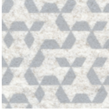
TRI Ash on Natural